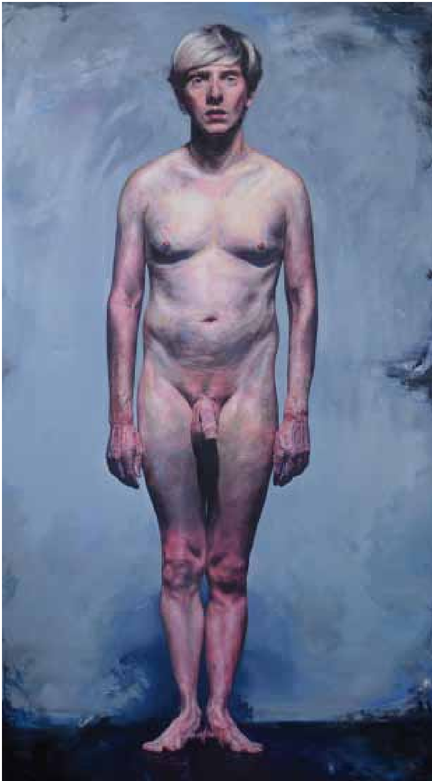
'Brendan' oil on canvas 240x120cm