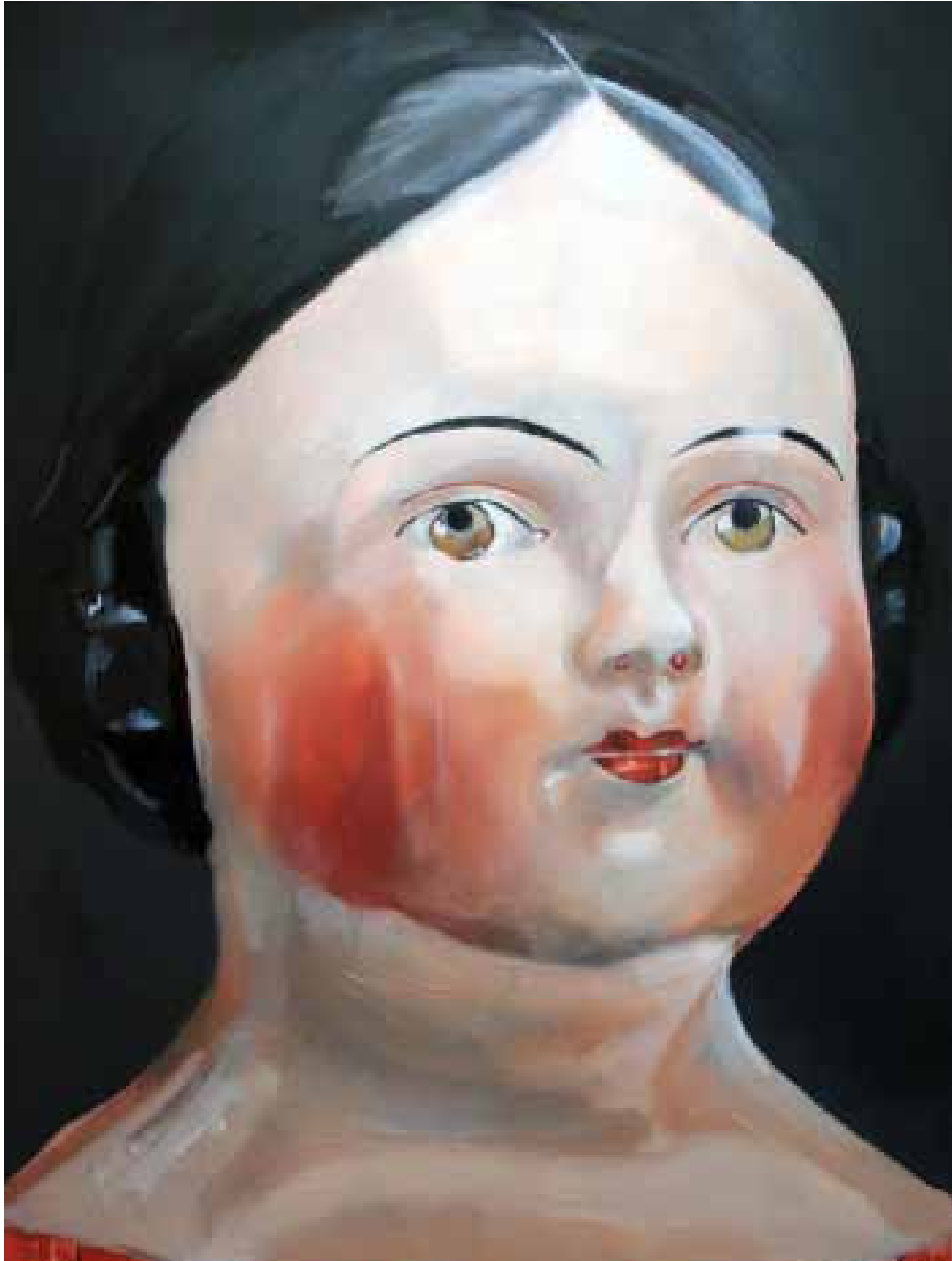
'Doll 1' oil on wood panel 25x35cm