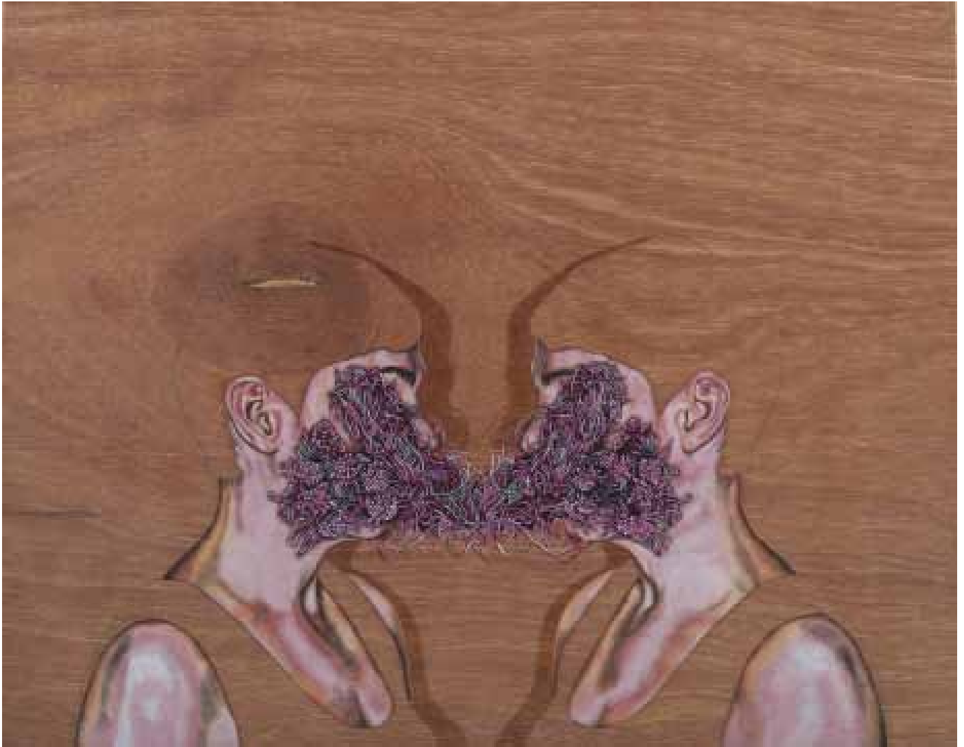
'The Heiress' oil on wood 58 x 70cm