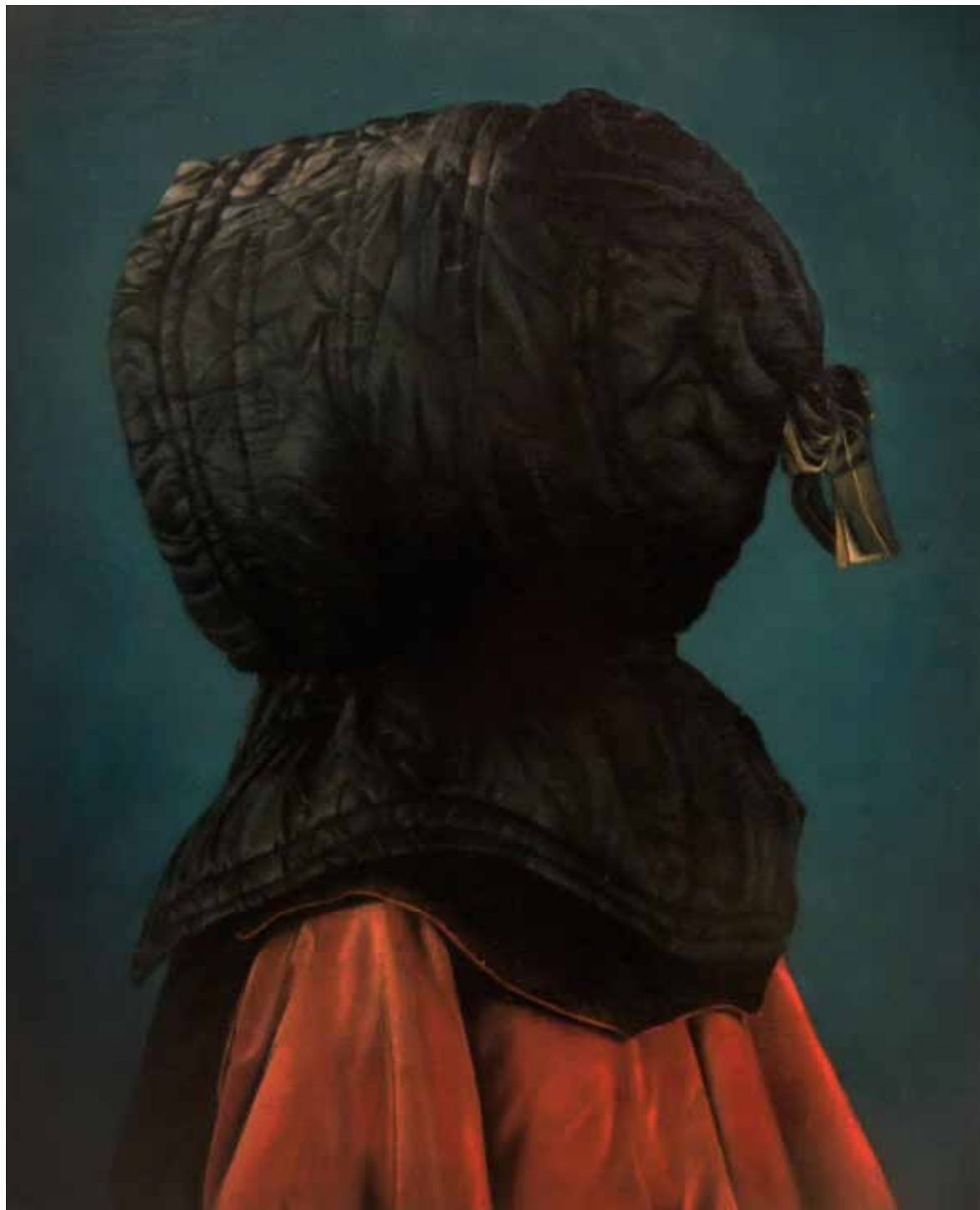
'Robe' oil on panel 40 x 50cm