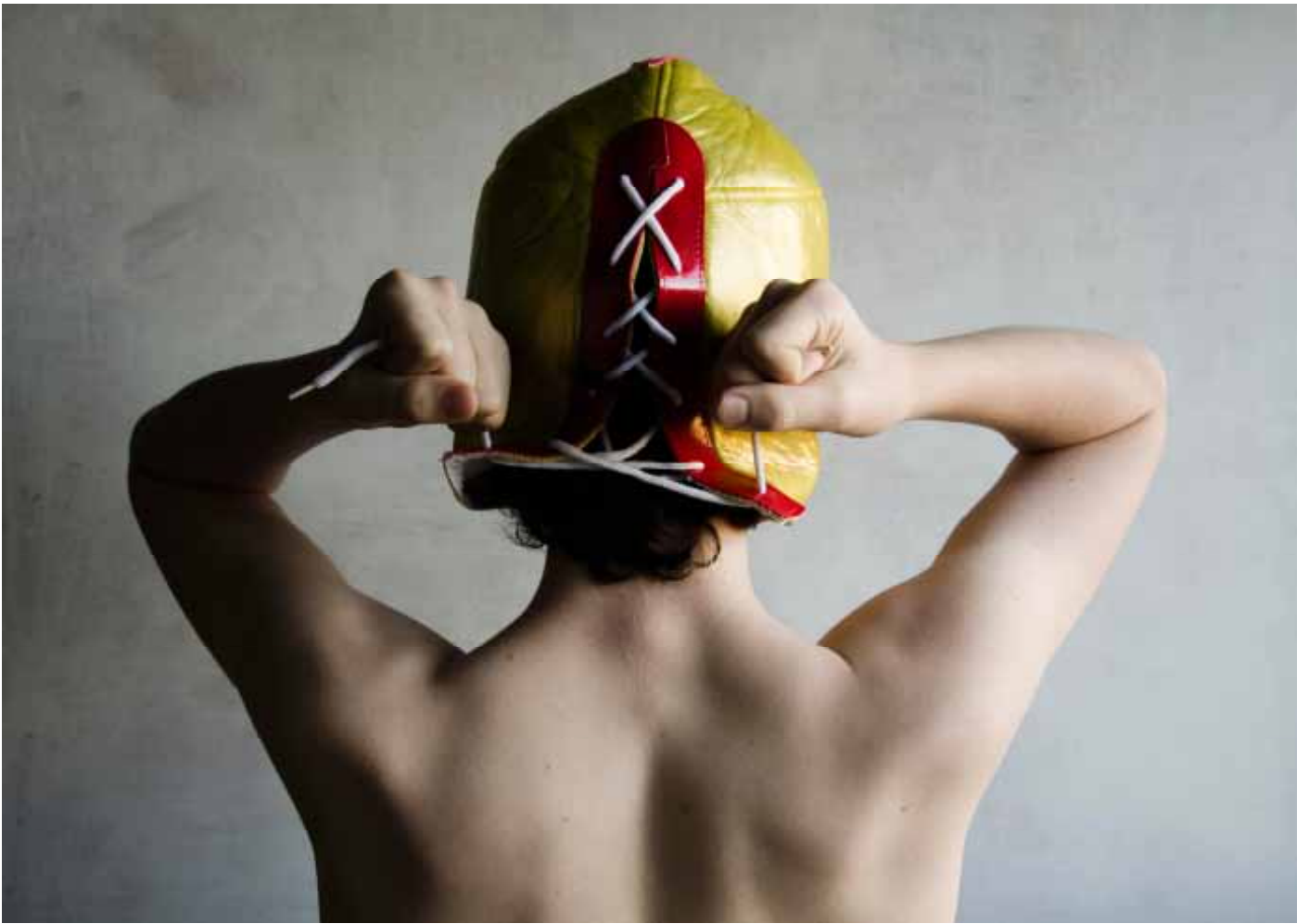
Suture : I photograph on panel 25x35cm